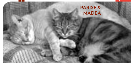
PARISE & MADEA

WEDNESDAY JULY 27: Project Thrive (2) meets at Club 216